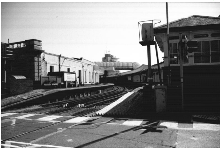
Folkestone Harbour Station. April 2000